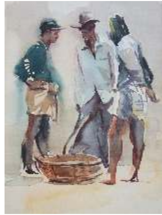
"Market", 2007, Water Colour, 36x26cm